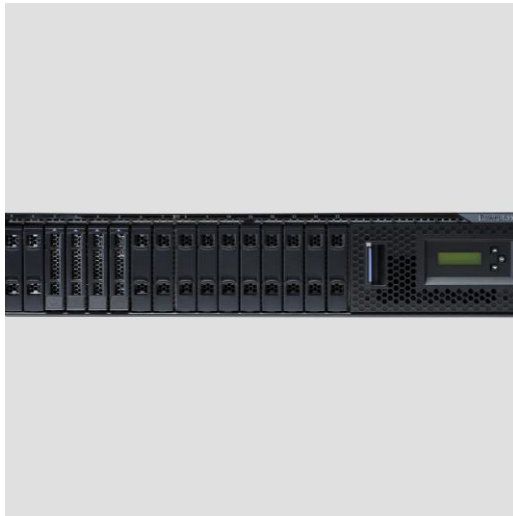
Figure 1. IBM Power S1122